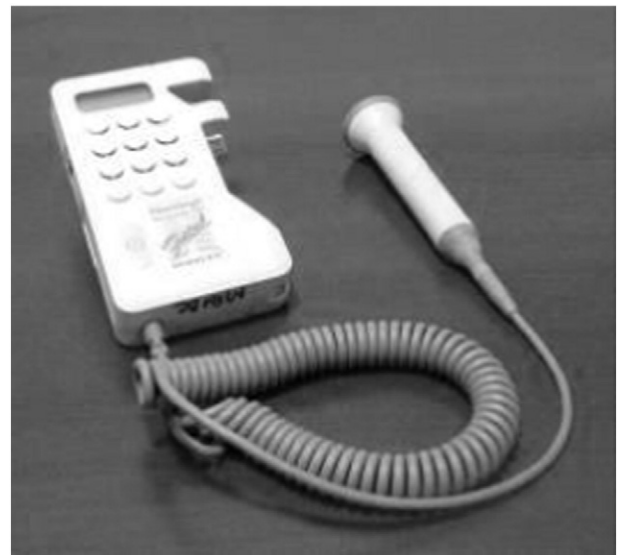
Fig. 4. Handheld Doppler device.

It takes time to develop clinical expertise with intermittent auscultation when performed with a fetal stethoscope [8,9]. Initially it may not be easy to recognize the fetal heart sounds, and later there is a slow learning curve for the identification of accelerations and decelerations. Even for the most experienced healthcare professionals, it is impossible to recognize subtle features of the FHR, such as variability. Using fetal stethoscopes, awkward positions sometimes need to be adopted for effective auscultation and therefore healthcare professionals should ensure good ergonomic position for themselves and the laboring woman when using intermittent auscultation. Also with these instruments, there is no independent record of the FHR and usually no confirmation of the findings by other healthcare professionals, or by those in the room. This may cause uncertainty in case reviews and medico-legal cases.